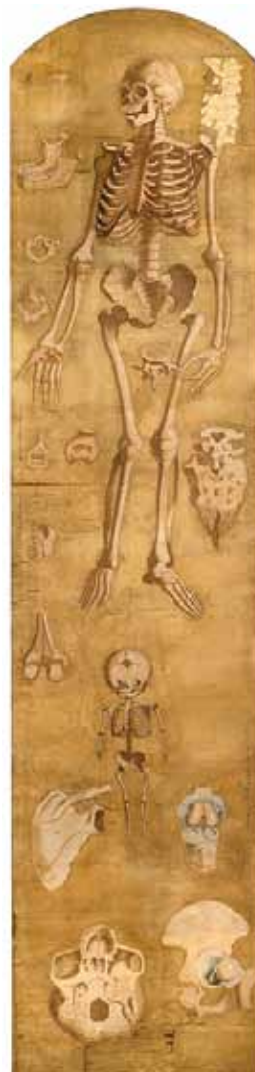
Painting of the skeletal system, Bourdon, c.1670