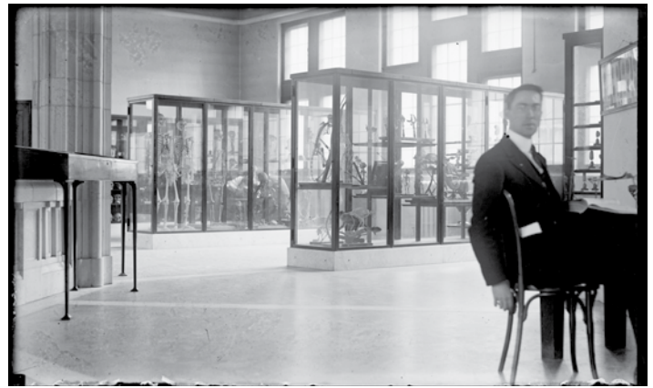
Photo of a single figure in the medical museum, item 41, James Lockhart Fonds, P194

A quick perusal of the images shows that the James Lockhart Fonds is stunning for both its subject matter and its documentary style. Dozens of shots show hitherto undocumented views of McGill's medical buildings and the nearby Royal Victoria Hospital. During Lockhart's time at McGill, medicine was taught in the neoclassical Strathcona Medical Building, which had been designed by Montreal architects Brown & Vallance in 1909 following a tragic fire in 1907 that destroyed an earlier medical building, aptly named Old Medical. Lockhart photographed the exterior of the elegant Strathcona building, as well as its stairways,